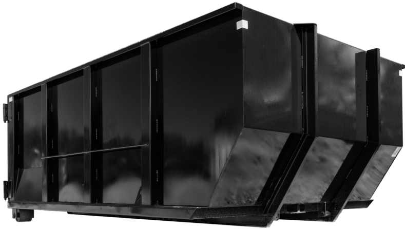
FORMED TOP RAIL