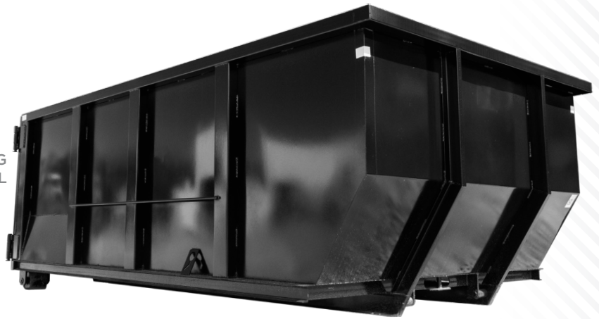
3"X3" TUBING TOP RAIL