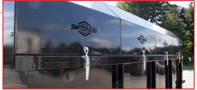
Removable Chipper Roof