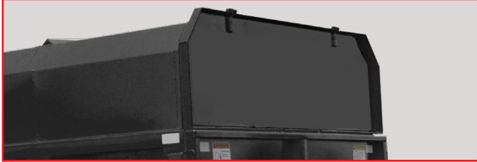
24" Rear Cover Plate Optional