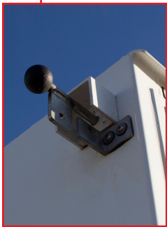
Master Lock System