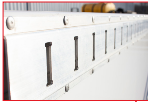
Full Length E-Track