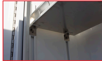
Customizable Storage Compartments